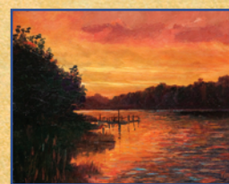
New Art Exhibit