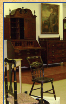
What's New in the Staas Gallery